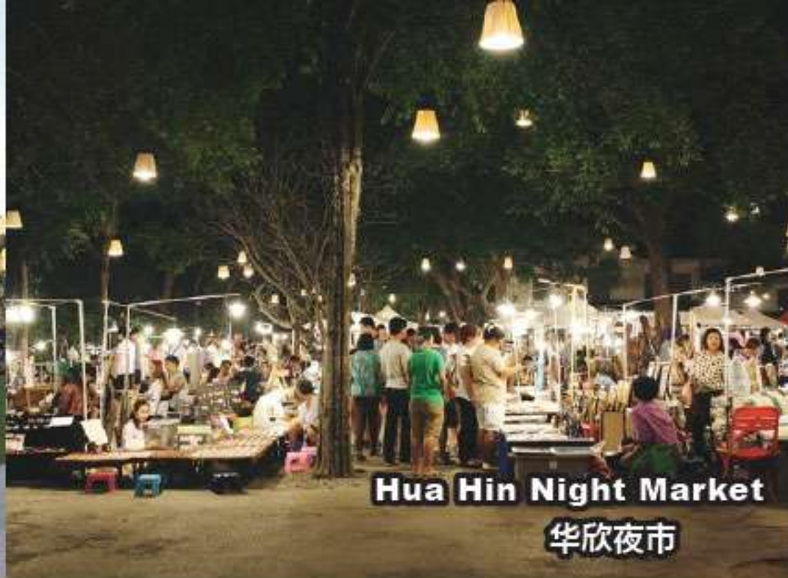
Hua Hin Night Market 华欣夜市