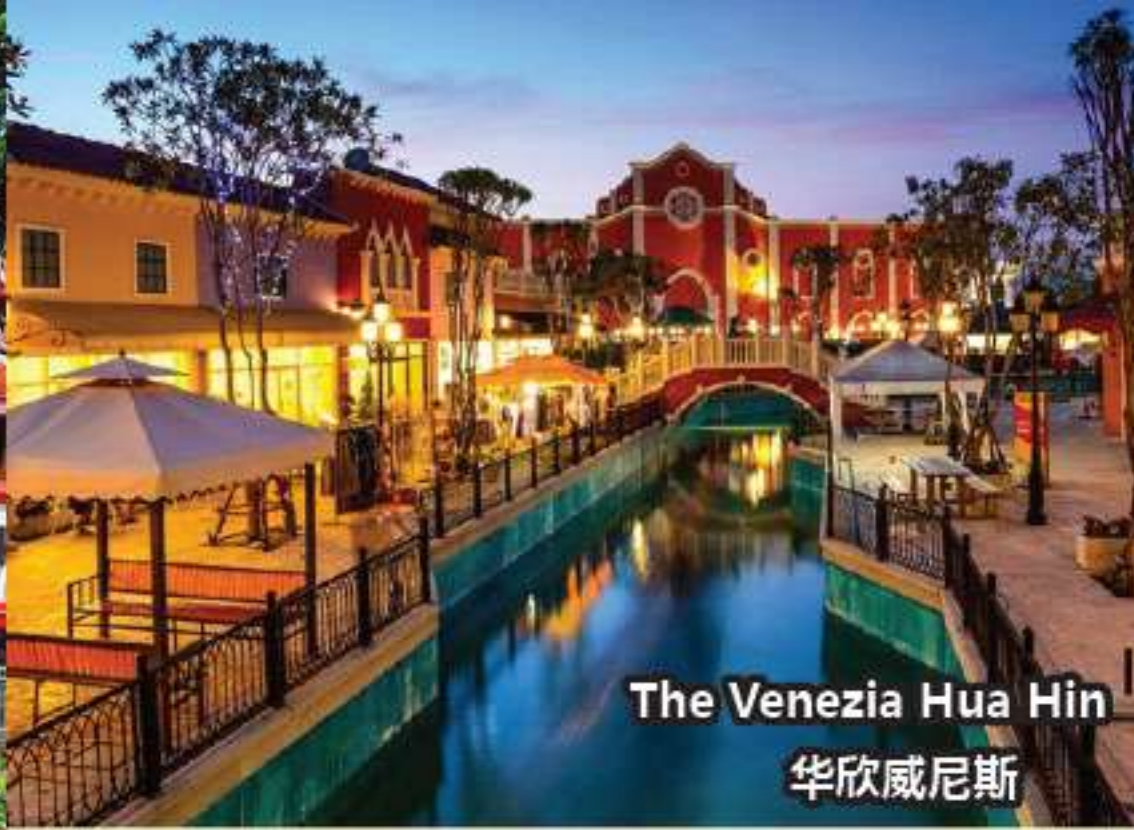
The Venezia Hua Hin 华欣威尼斯