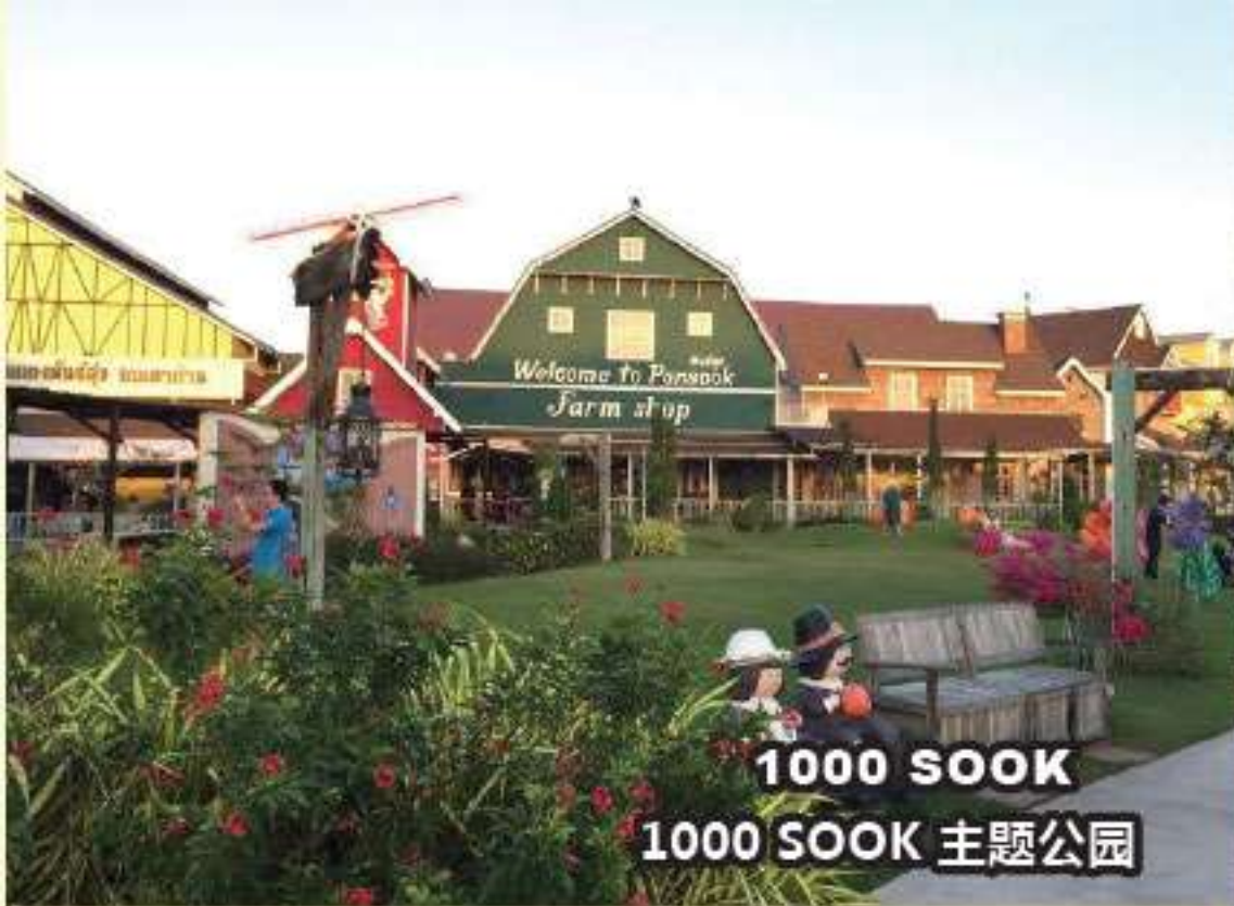
1000 SOOK 1000 SOOK 主题公园