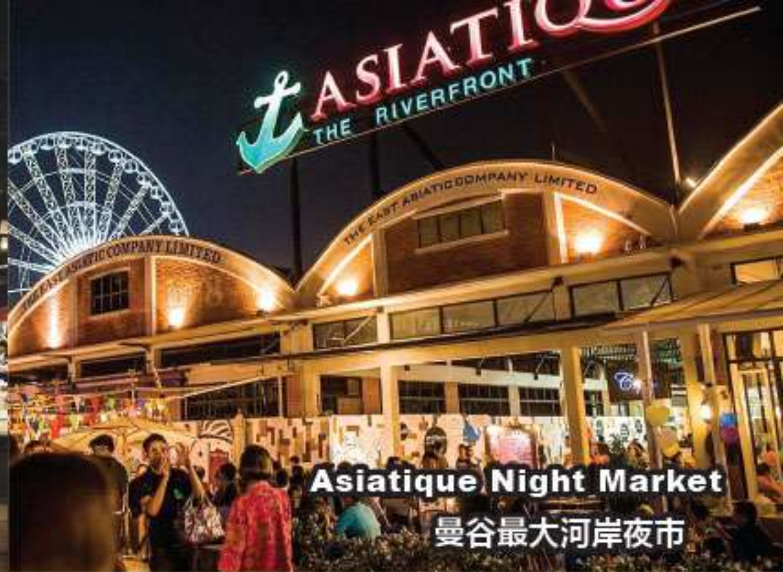
Asiatique Night Market 曼谷最大河岸夜市