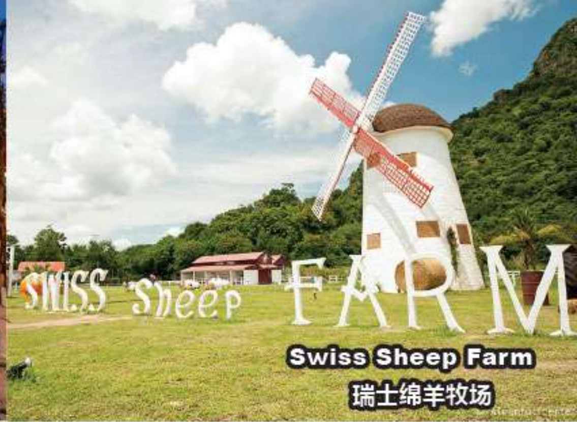
Swiss Sheep Farm 瑞士绵羊牧场