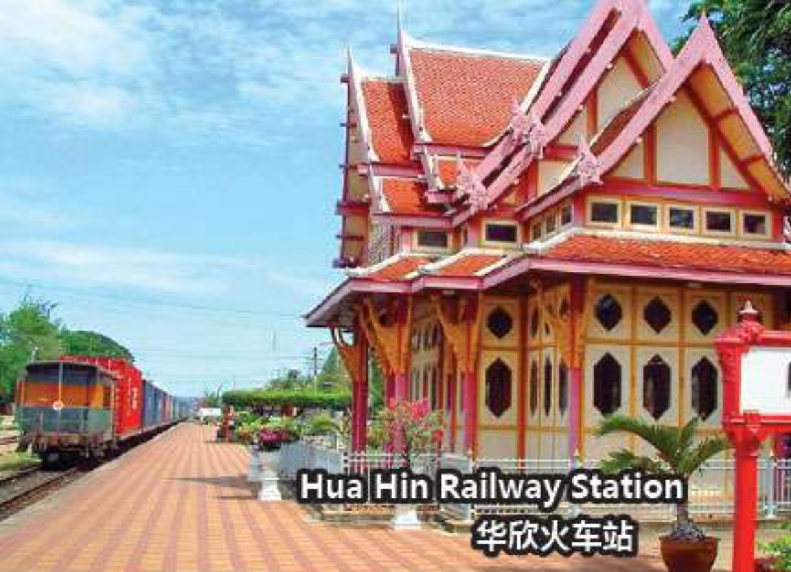
Hua Hin Railway Station 华欣火车站