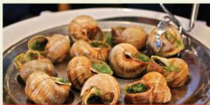
巴黎 - 法國蝸牛