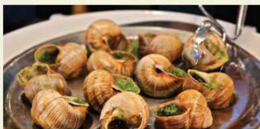
French Cuisine with Escargot