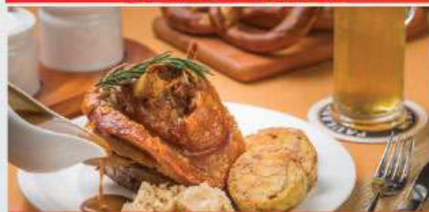
滴滴湖 - 德国烤猪脚