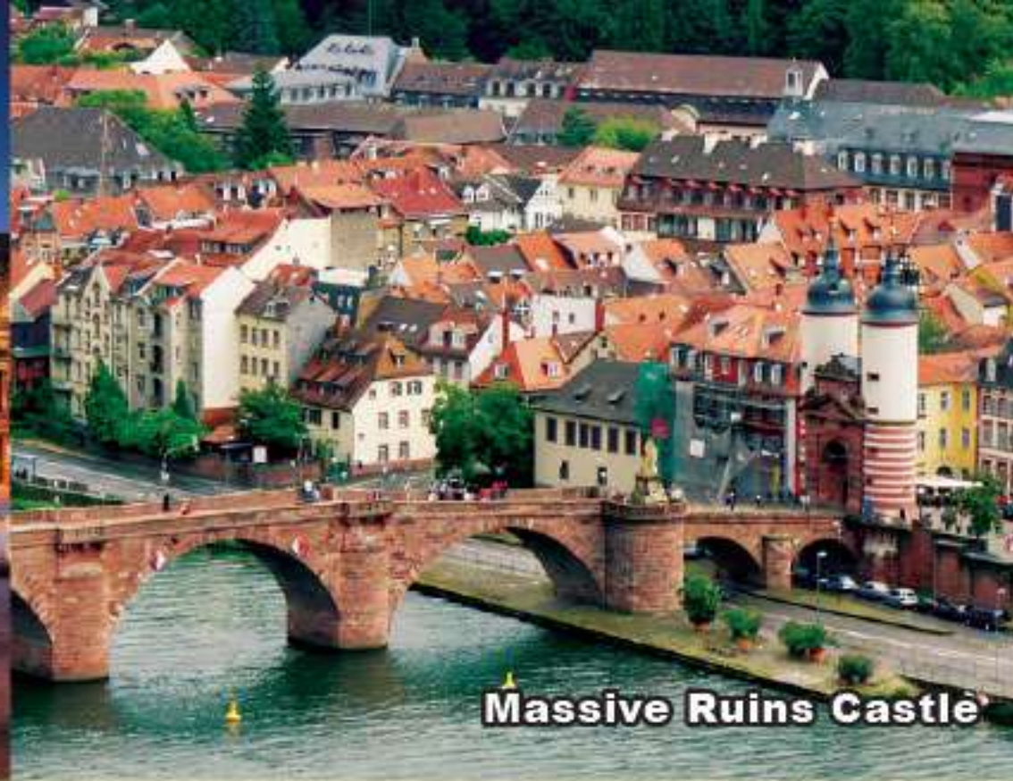
Massive Ruins Castle