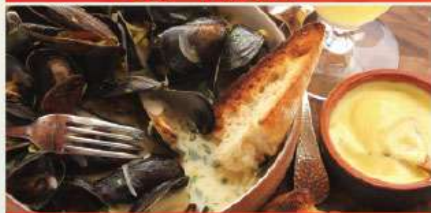
布鲁塞尔 - 青口贝