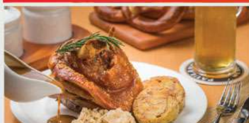
German Lunch with Pork Knuckle