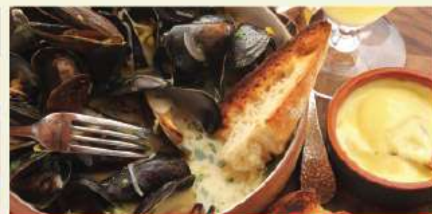
布鲁塞尔 - 青口贝