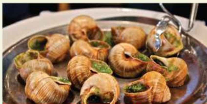
巴黎 - 法國蝸牛