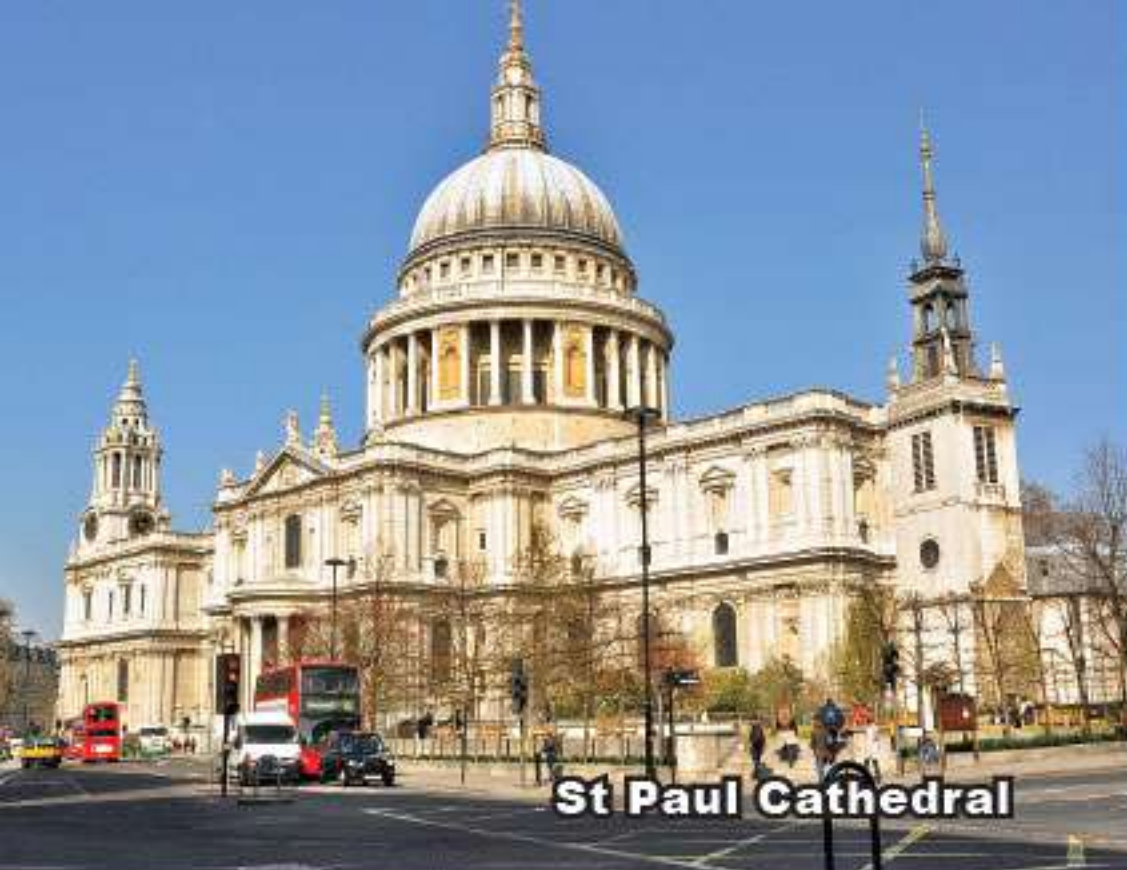
St Paul Cathedral