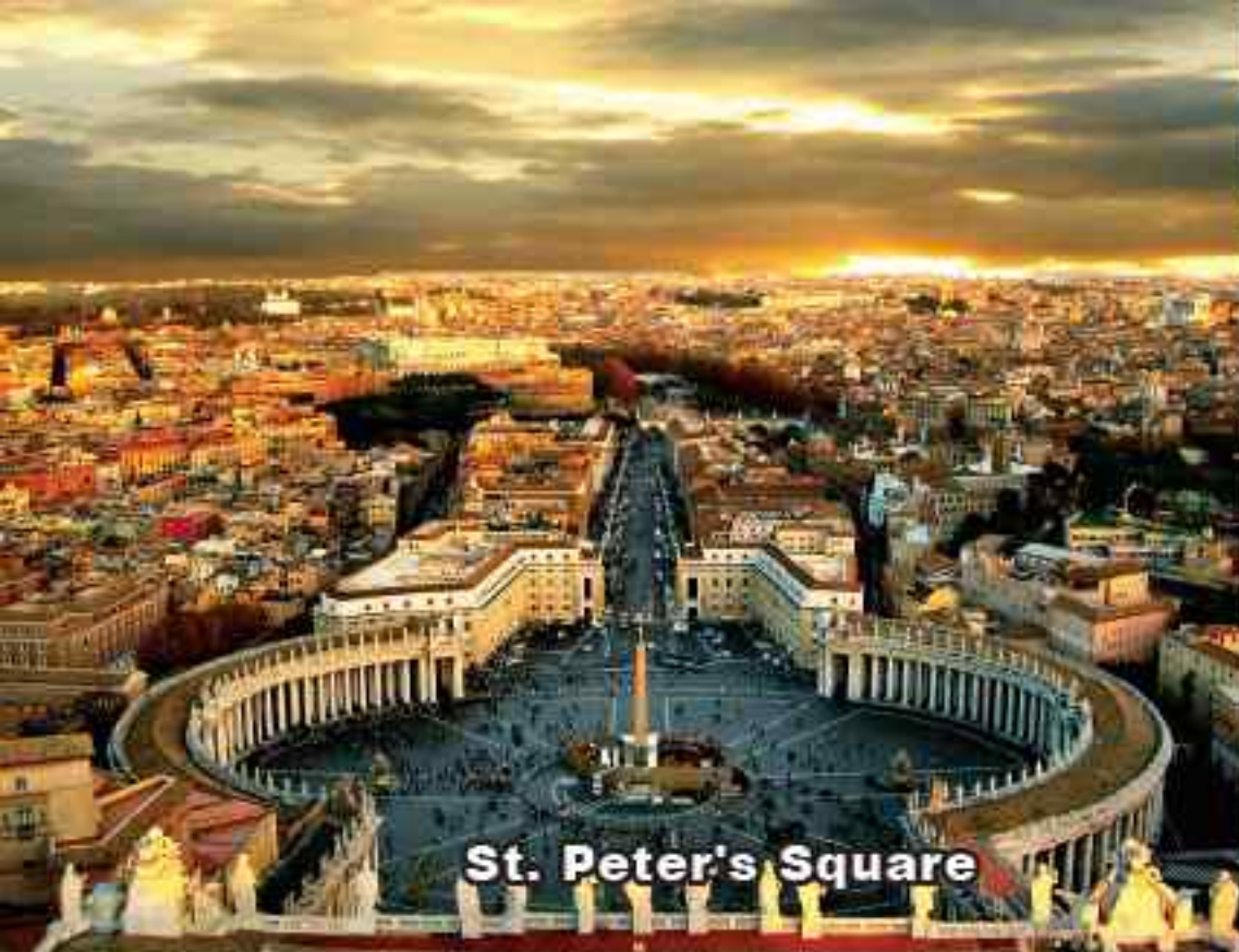
St. Peter's Square