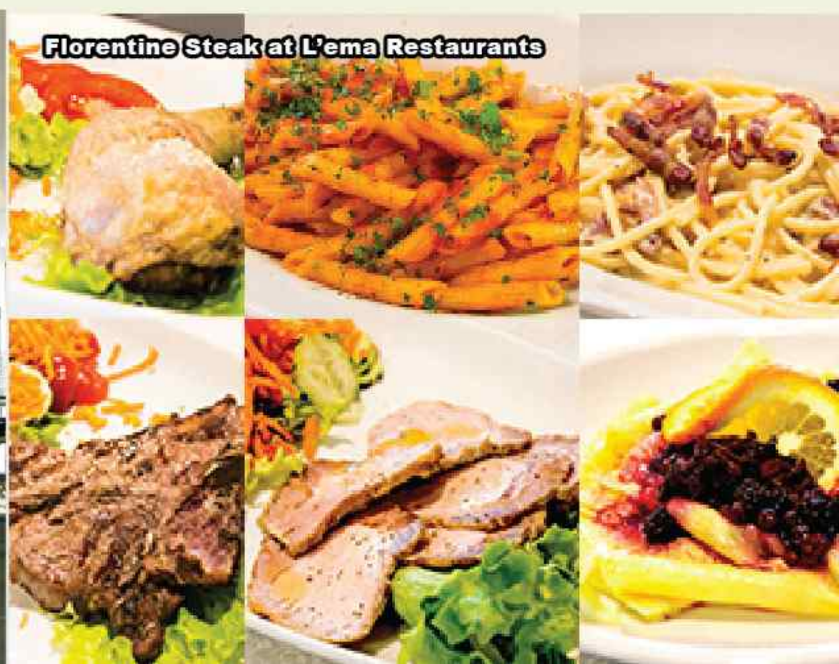
Florentine Steak at L'ema Restaurants