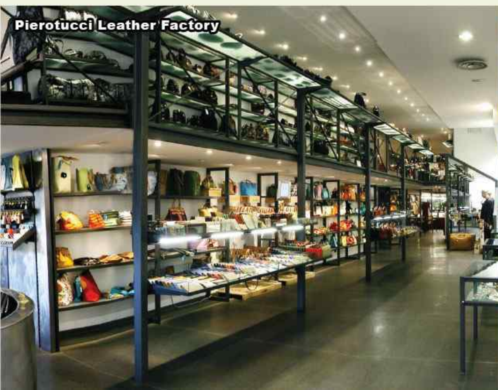
Pierotucci Leather Factory