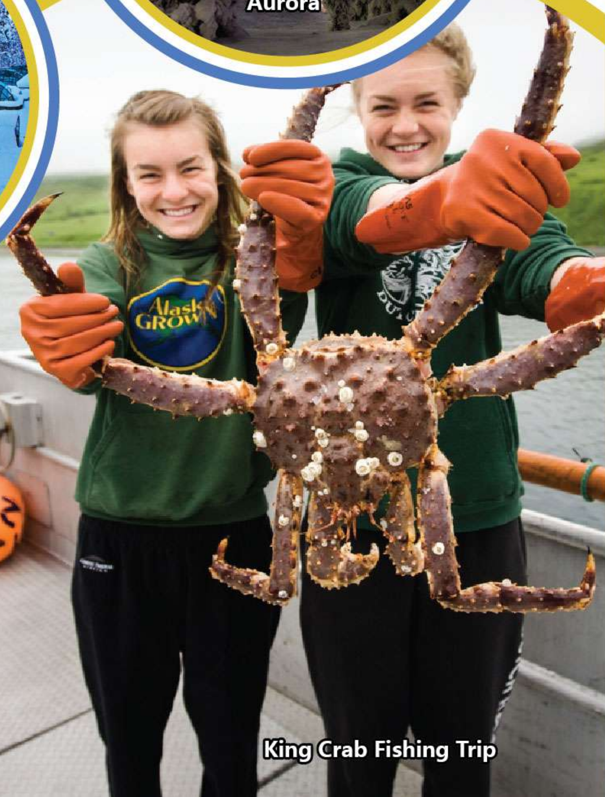
King Crab Fishing Trip