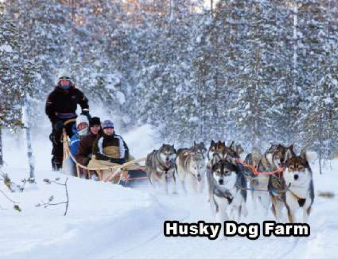
Husky Dog Farm