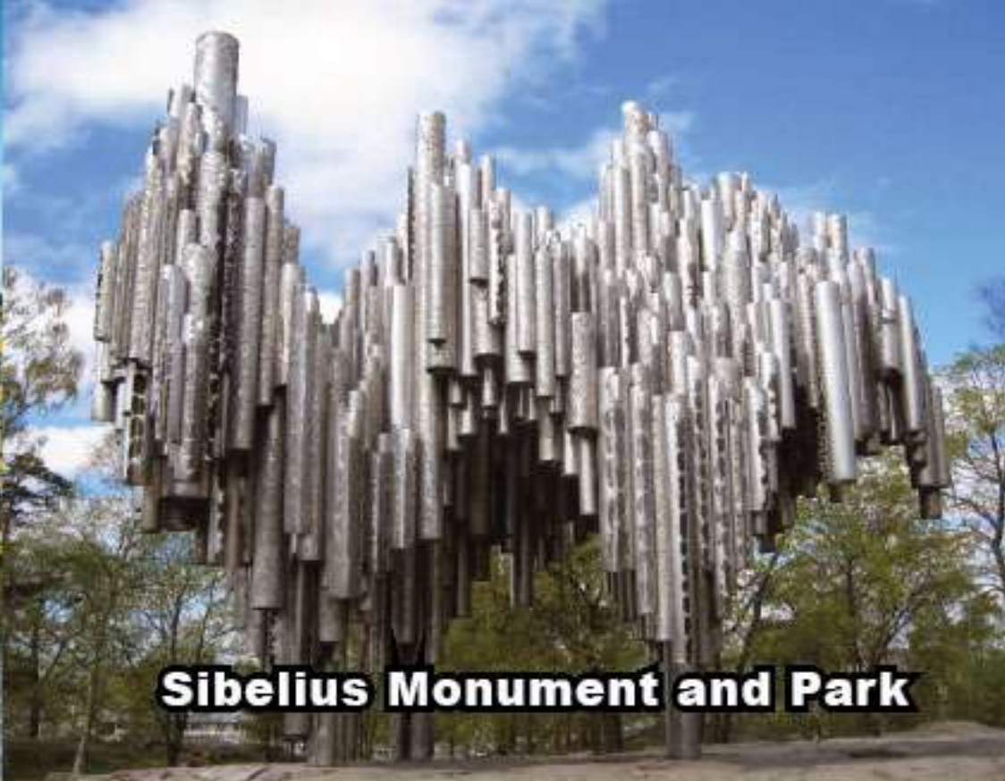
Sibelius Monument and Park