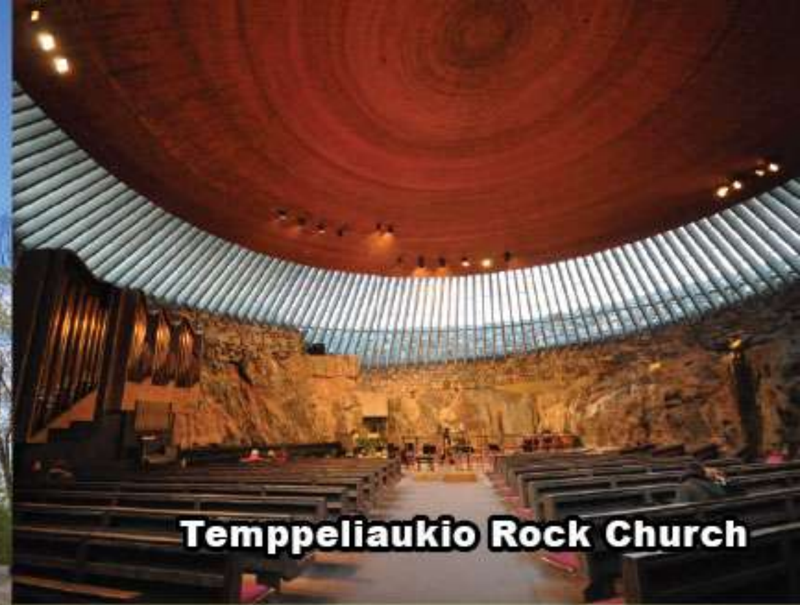
Tempeliaukio Rock Church