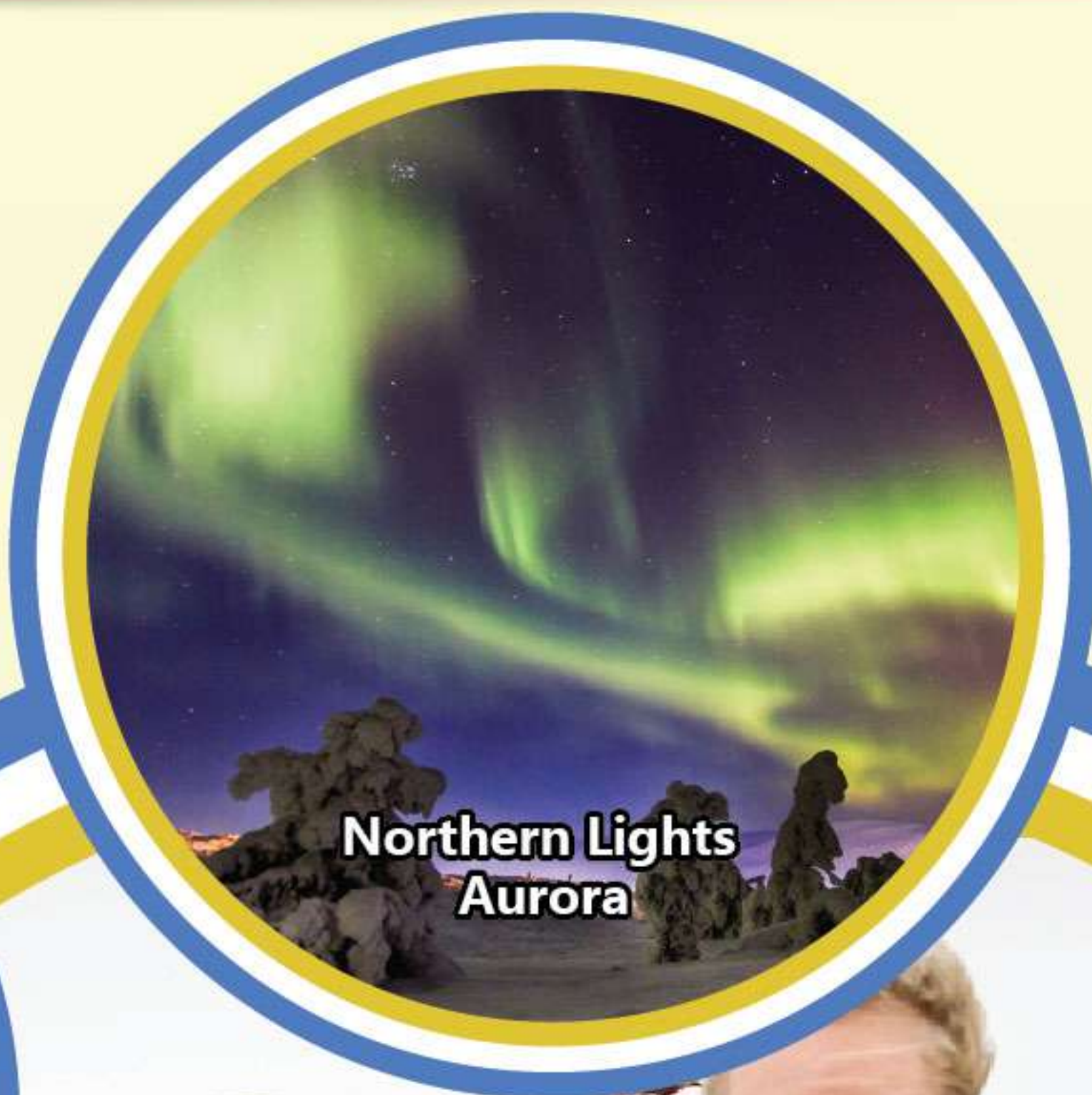
Northern Lights Aurora