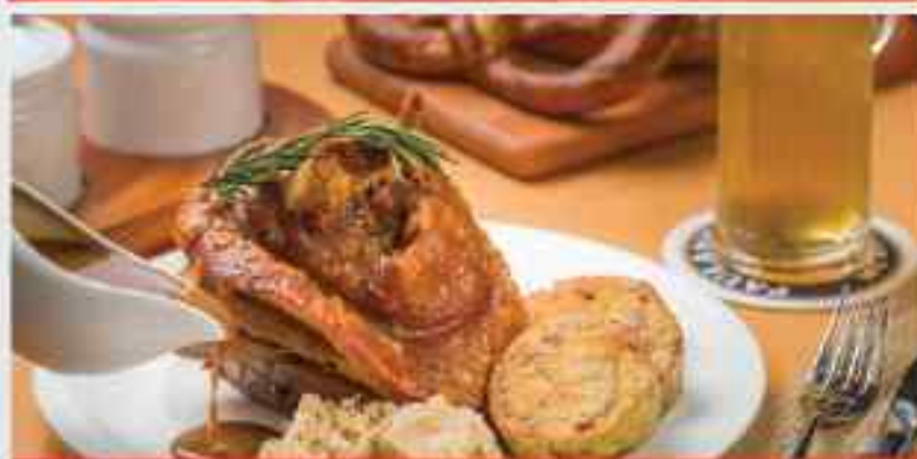
German Lunch with Pork Knuckle