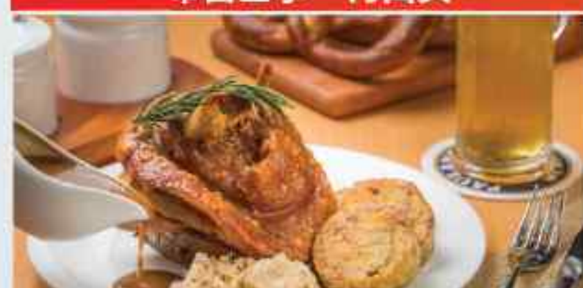
滴滴湖 - 德国烤猪脚