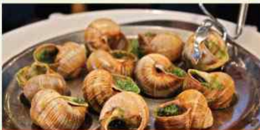
French Cuisine with Escargot