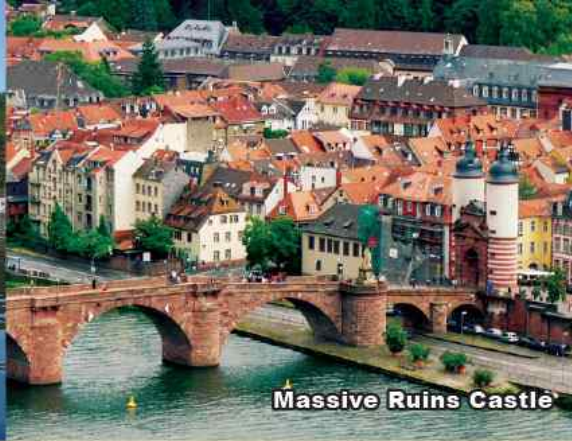
Massive Ruins Castle