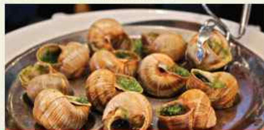
巴黎 - 法國蝸牛