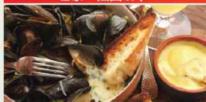
布鲁塞尔 - 青口贝