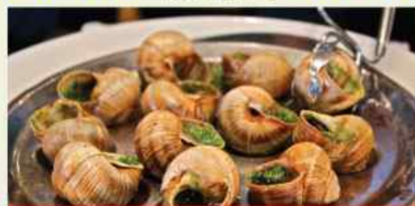
巴黎 - 法國蝸牛