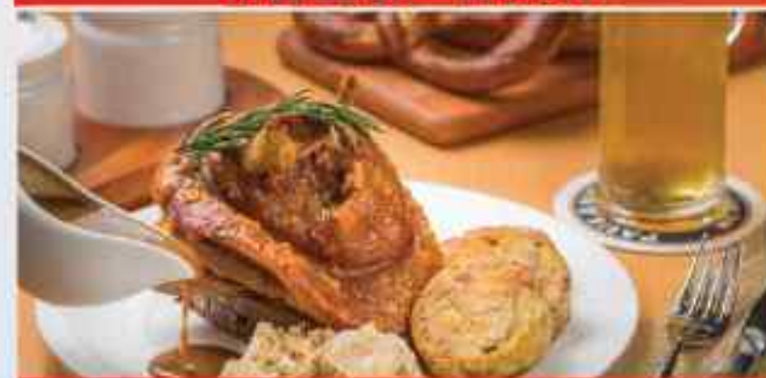
滴滴湖 - 德国烤猪脚