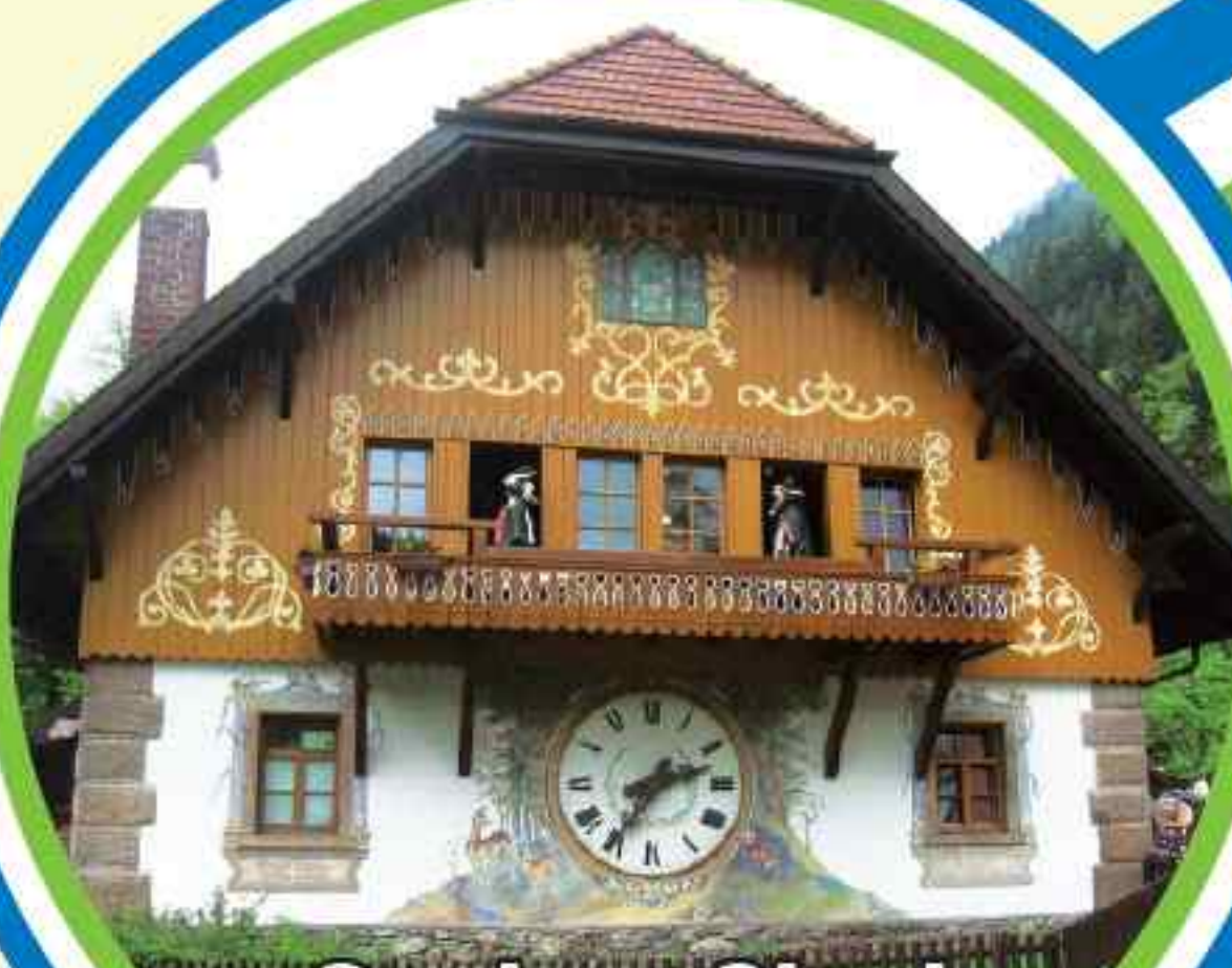
Cuckoo Clock Factories