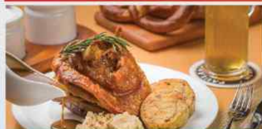
German Lunch with Pork Knuckle