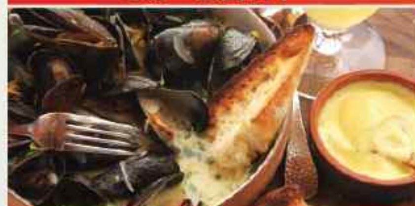
布鲁塞尔 - 青口贝