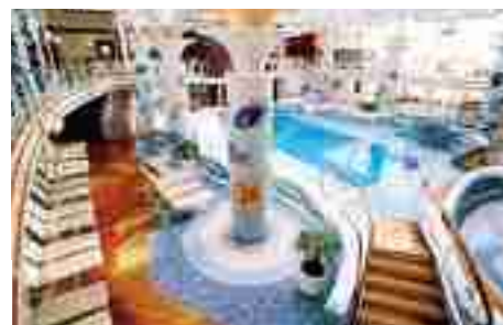
克利索泳池Calypso Reef and Pool