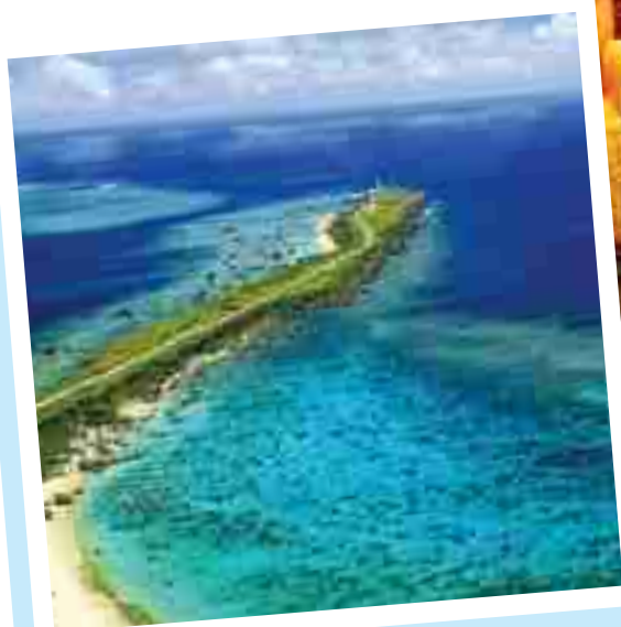
东平安名崎(宫古岛) Cape Higashihennazaki (Miyakojima)