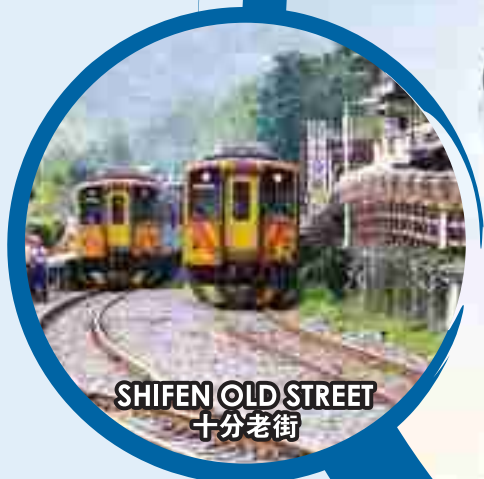
SHIFEN OLD STREET 十分老街