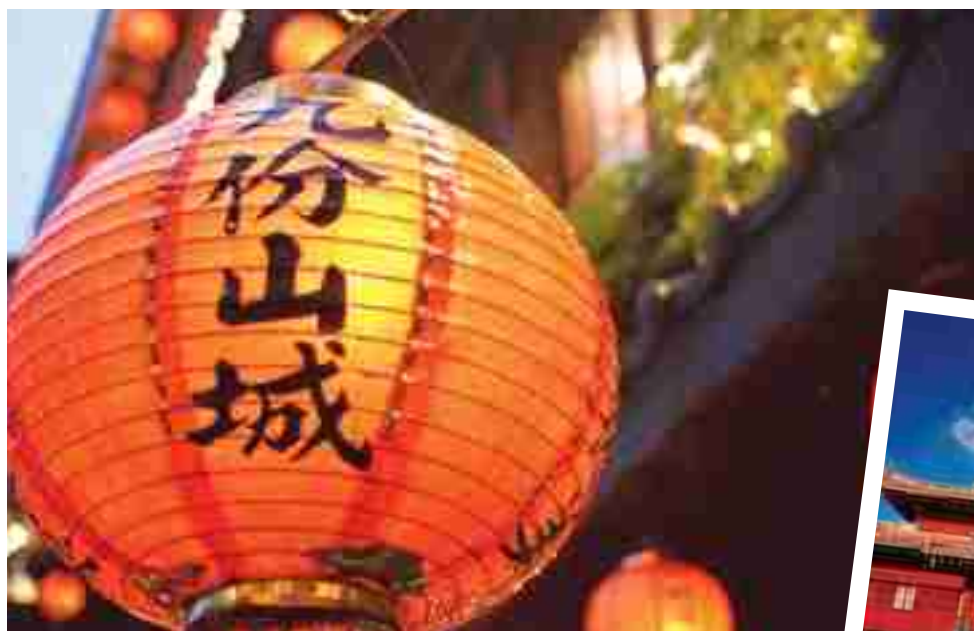
九份 (台北) Jiufen (Taipei)