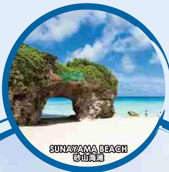
SUNAYAMA BEACH 砂山海滩