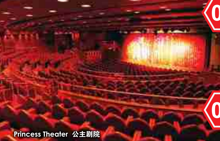
Princess Theater 公主剧院