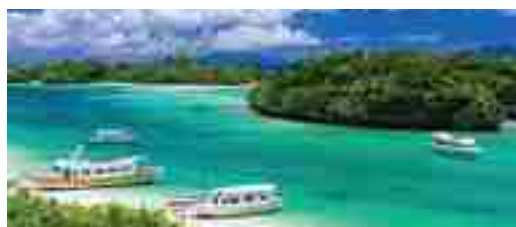
川平湾 (石垣岛) Kabira Bay (Ishigaki)