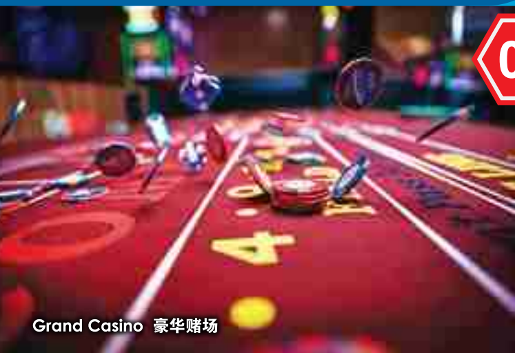
Grand Casino 豪华赌场