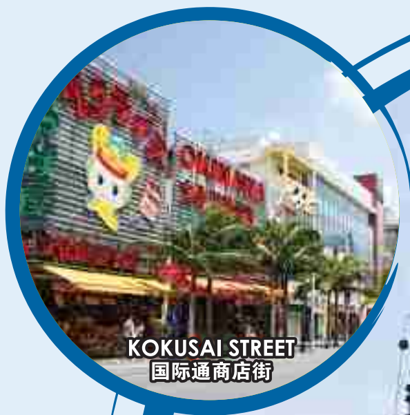
KOKUSAI STREET 国际通商店街