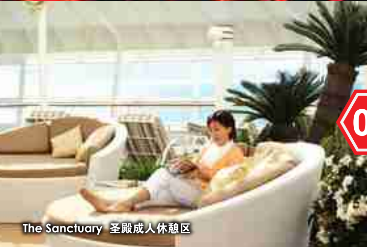
The Sanctuary 圣殿成人休憩区