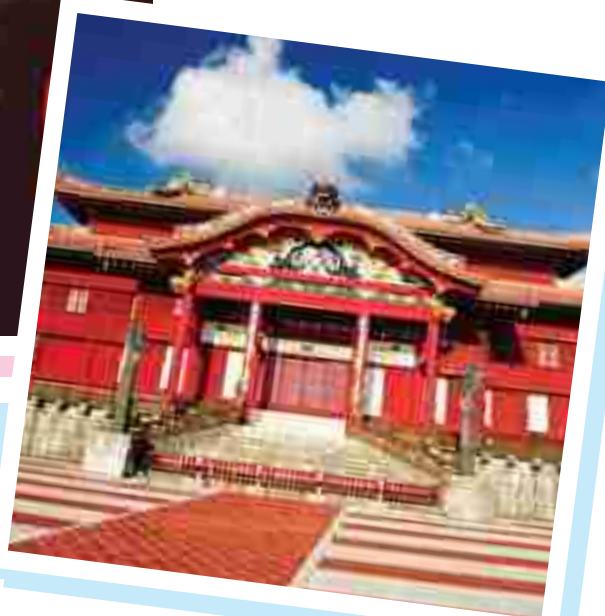
首里城 (冲绳) Shuri Castle (Okinawa)