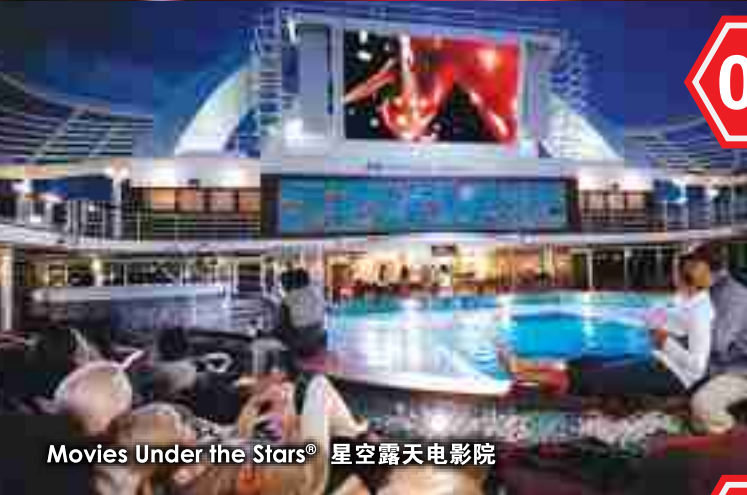
Movies Under the Stars® 星空露天电影院