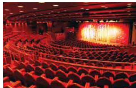
公主剧院 Princess Theater