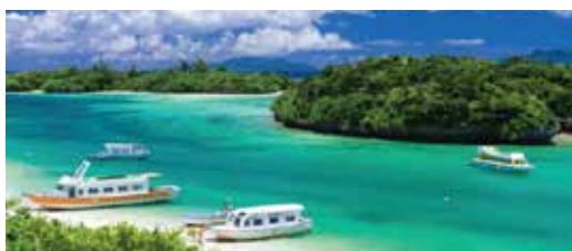
川平湾 (石垣岛) Kabira Bay (Ishigaki)