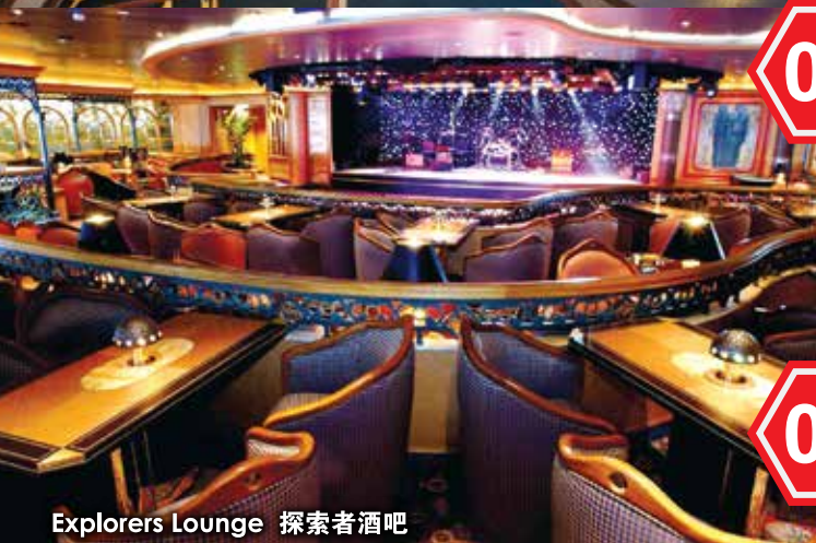
Explorers Lounge 探索者酒吧