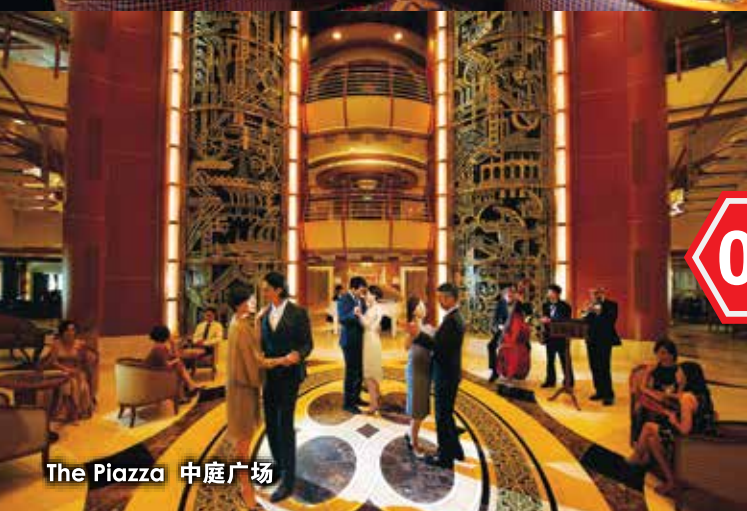
The Piazza 中庭广场