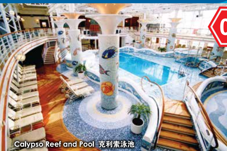
Calypso Reef and Pool 克利索泳池