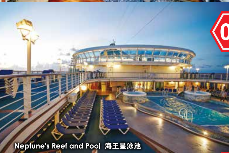
Nepfune's Reef and Pool 海王星泳池