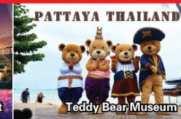
Teddy Bear Museum