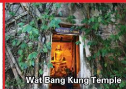
Wat Bang Kung Temple