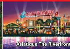
Asiatique The Riverfront