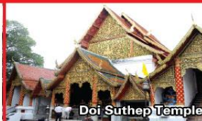
Doi Suthep Temple