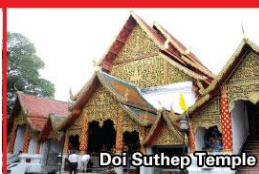
Doi Suthep Temple