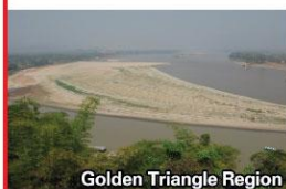
Golden Triangle Region