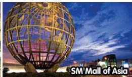
SM Mall of Asia