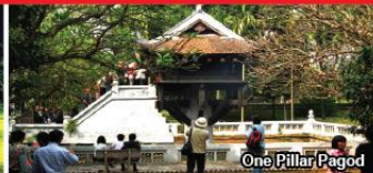
One Pillar Pagoda