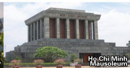
Ho Chi Minh Mausoleum

Optional Tour: • Tricycle (Included Tips) [USD 8] • Halong Cruise Extra 2 hours to Titop Island [USD 23] • Small Boat Cruise to Tunnel [USD 14]