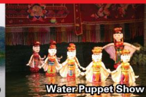
Water Puppet Show