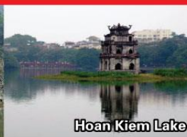
Hoan Kiem Lake