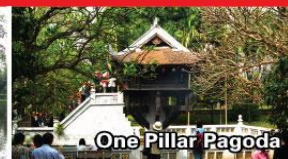
One Pillar Pagoda