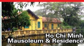
Ho Chi Minh Mausoleum & Residence