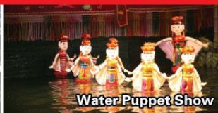
Water Puppet Show