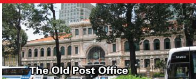
The Old Post Office