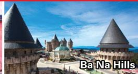
Ba Na Hills