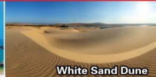
White Sand Dune