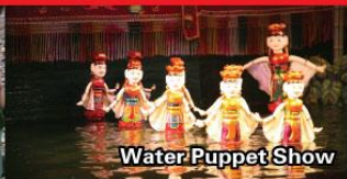
Water Puppet Show