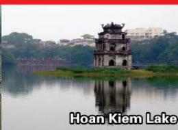
Hoan Kiem Lake