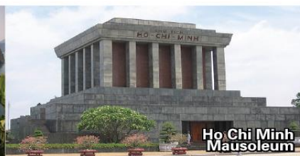
Ho Chi Minh Mausoleum

Optional Tour: • Tricycle (Included Tips) [USD 16] • Halong Cruise Extra 2 hours to Titop Island [USD 23] • Small Boat Cruise to Tunnel [USD 14]