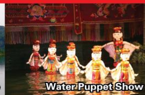
Water Puppet Show