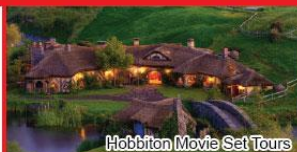
Hobbiton Movie Set Tours