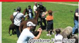
Agrodome Farm Show