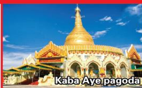
Kaba Aye pagoda