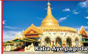
Kaba Aye pagoda