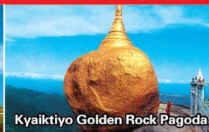
Kyaikhtiyo Golden Rock Pagoda