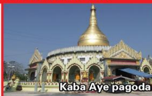
Kaba Aye pagoda