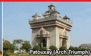
Patouxay (Arch Triumph)