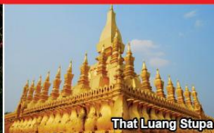
That Luang Stupa