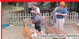
Todai-ji Temple (NARA)