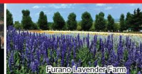
Furano Lavender Farm