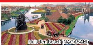
Huis Ten Bosch (NAGASAKI)