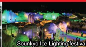
Sounkyo Ice Lighting festival