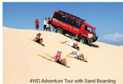
4WD Adventure Tour with Sand Boarding