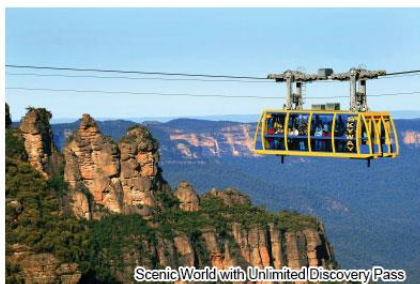
Scenic World with Unlimited Discovery Pass