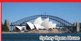
Sydney Opera House