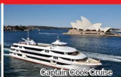
Captain Cook Cruise