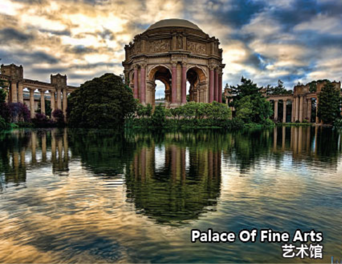
Palace Of Fine Arts 艺术馆