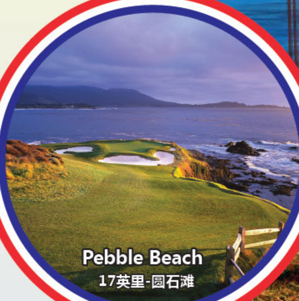
Pebble Beach 17英里-圆石滩