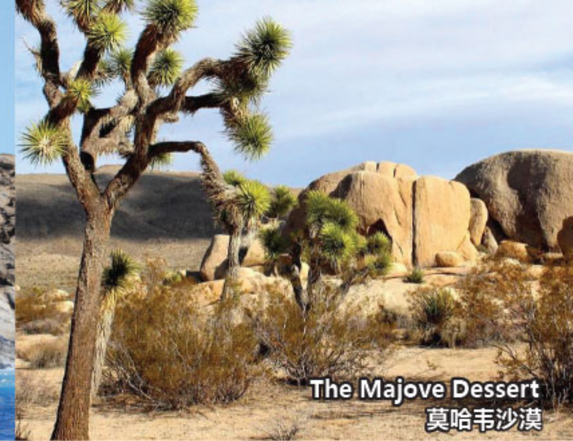
The Mojave Desert 莫哈韦沙漠