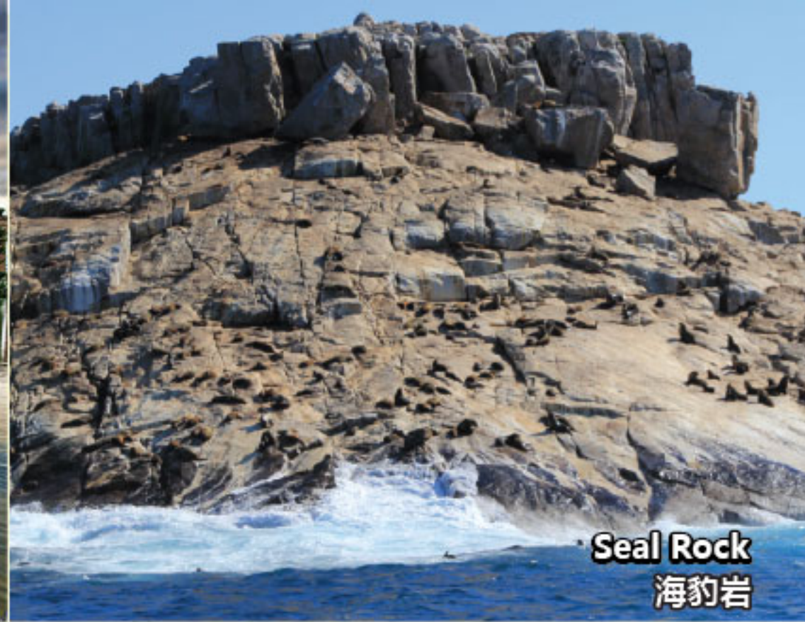
Seal Rock 海豹岩