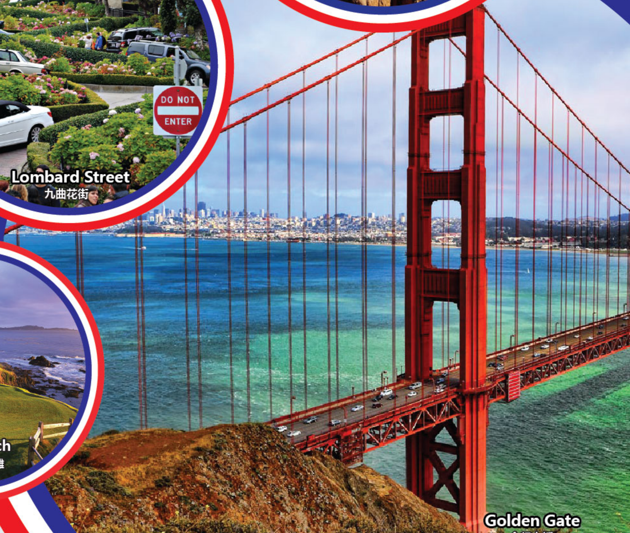
Golden Gate 金门大桥