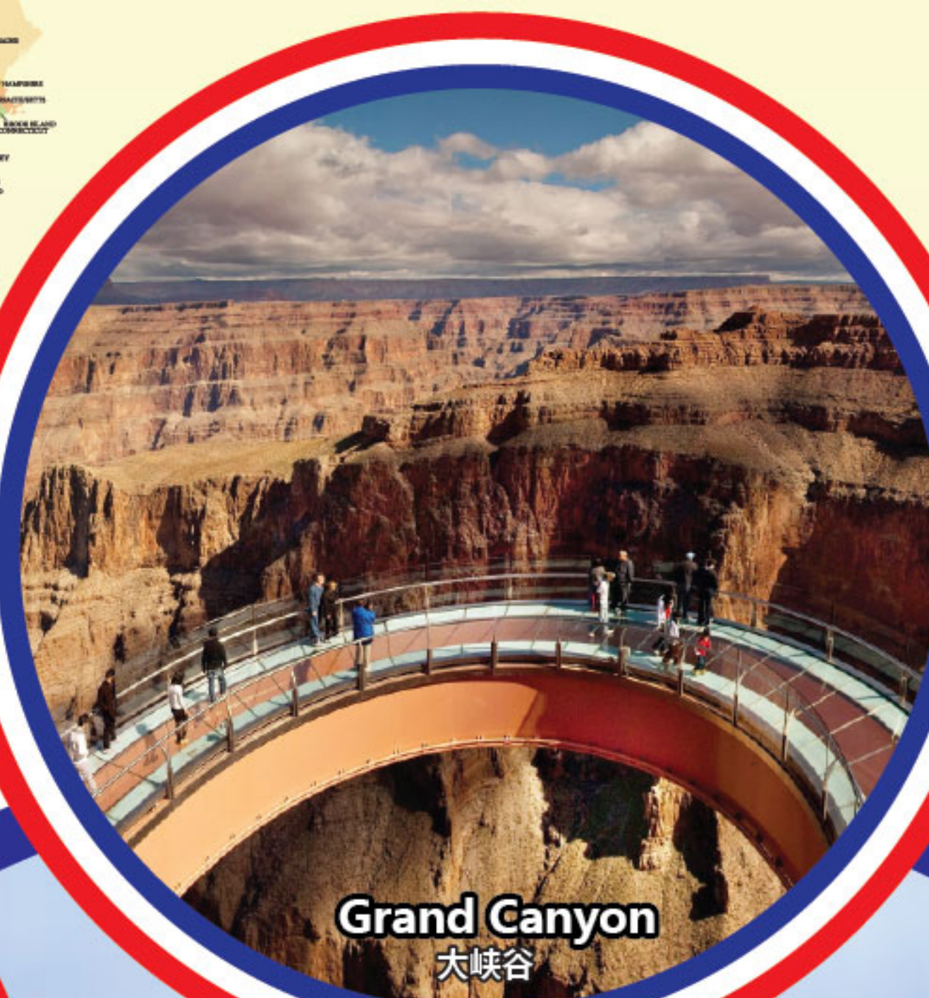
Grand Canyon 大峡谷