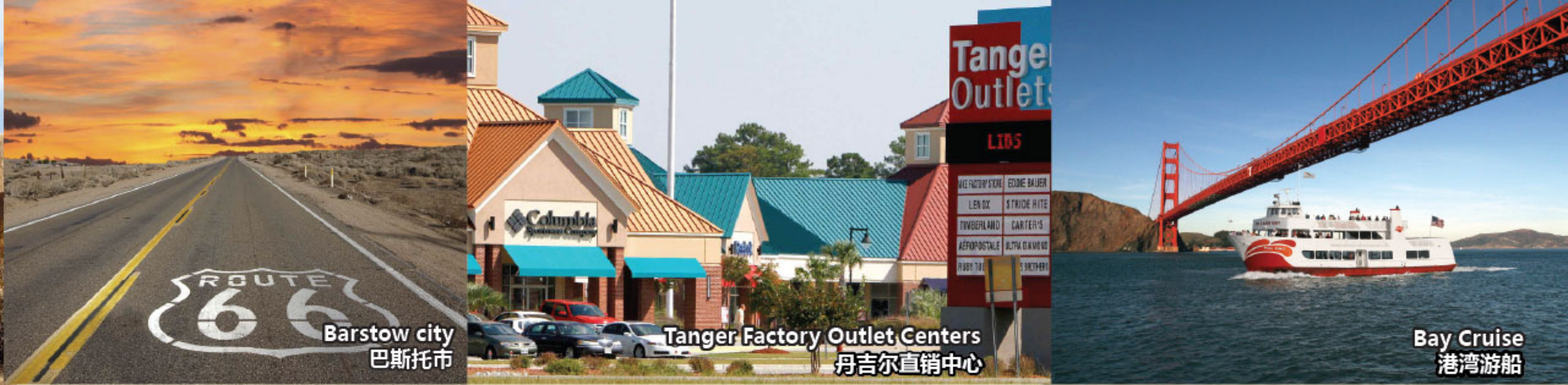
Barstow city 巴斯托市