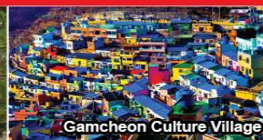
Gamcheon Culture Village