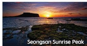
Seongsan Sunrise Peak