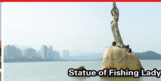
Statue of Fishing Lady