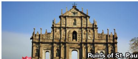
Ruins of St. Paul