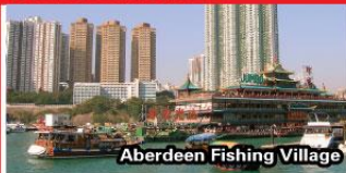
Aberdeen Fishing Village