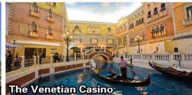
The Venetian Casino