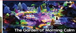
The Garden of Morning Calm