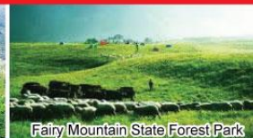
Fairy Mountain State Forest Park