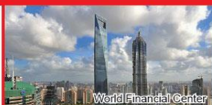
World Financial Center