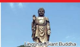
Lingshan Giant Buddha