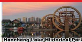
Hancheng Lake Historical Park