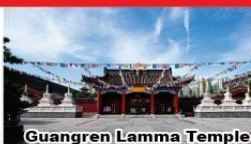
Guangren Lamma Temple