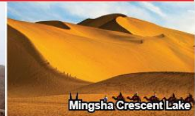
Mingsha Crescent Lake