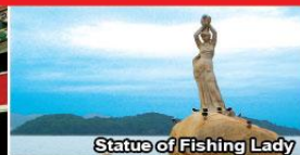
Statue of Fishing Lady