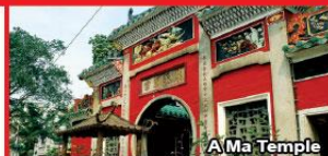
A Ma Temple