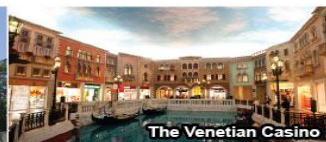
The Venetian Casino