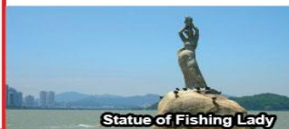
Statue of Fishing Lady