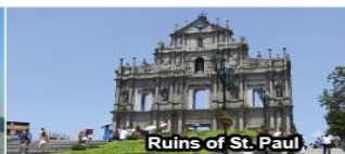
Ruins of St. Paul