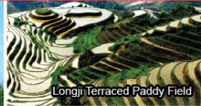
Longji Terraced Paddy Field