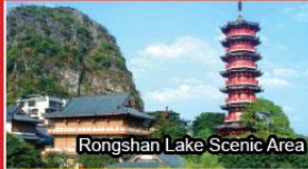
Rongshan Lake Scenic Area