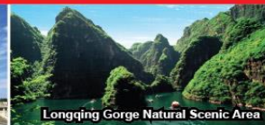
Longqing Gorge Natural Scenic Area