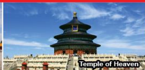
Temple of Heaven