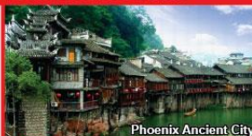
Phoenix Ancient City