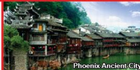
Phoenix Ancient City