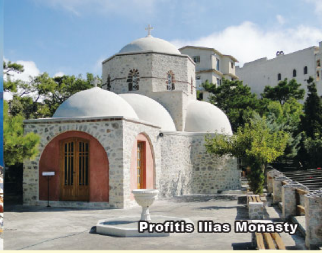
Profitis Ilias Monastery