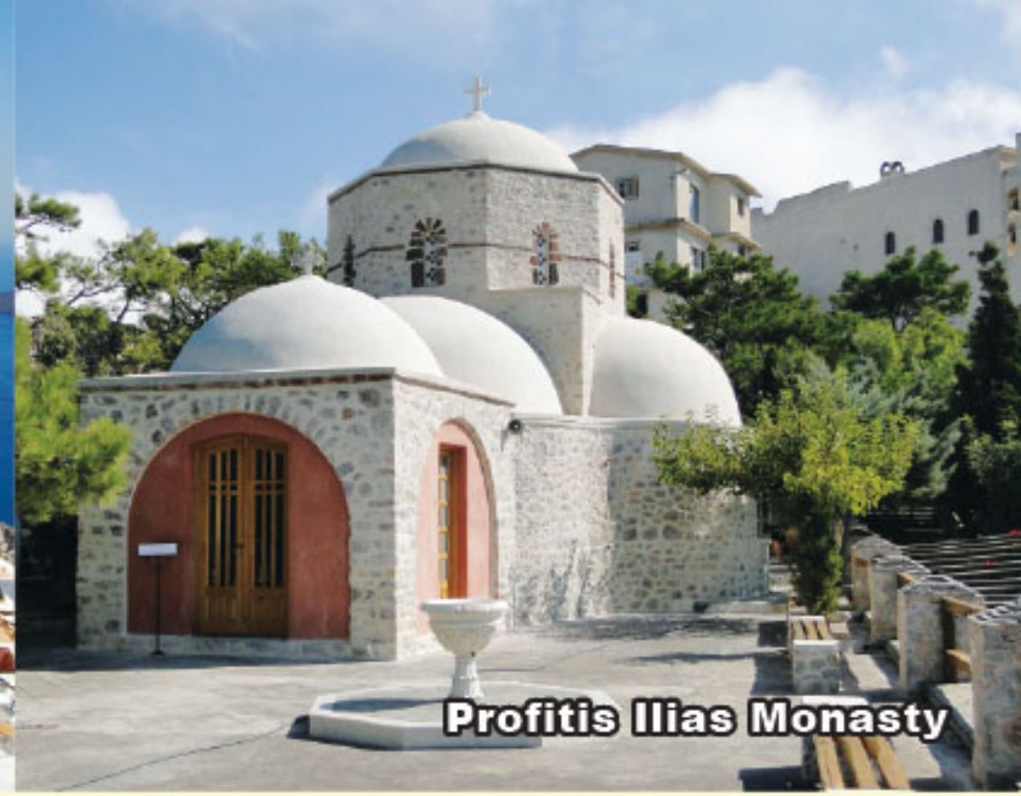
Profitis Ilias Monastery