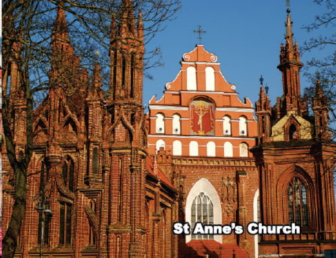
St Anne's Church