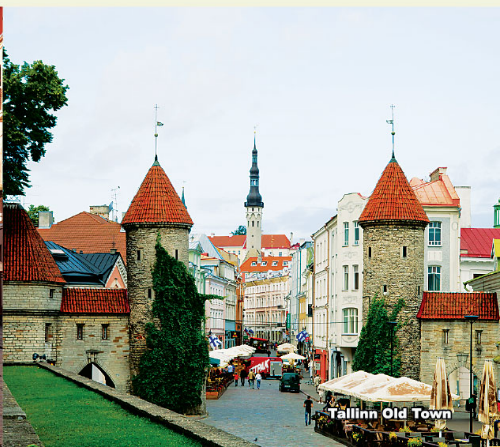
Tallinn Old Town