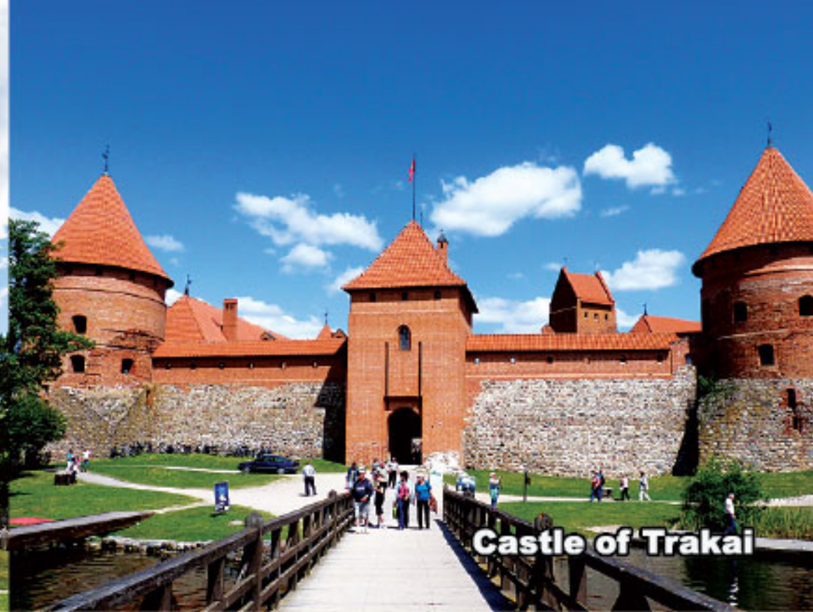
Castle of Trakai