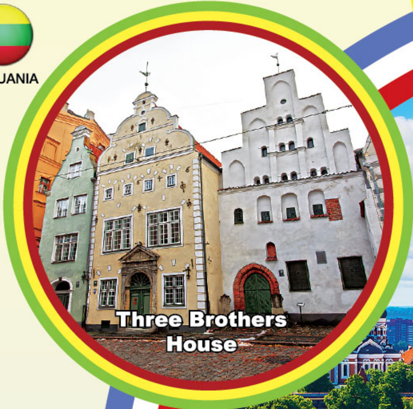
Three Brothers House