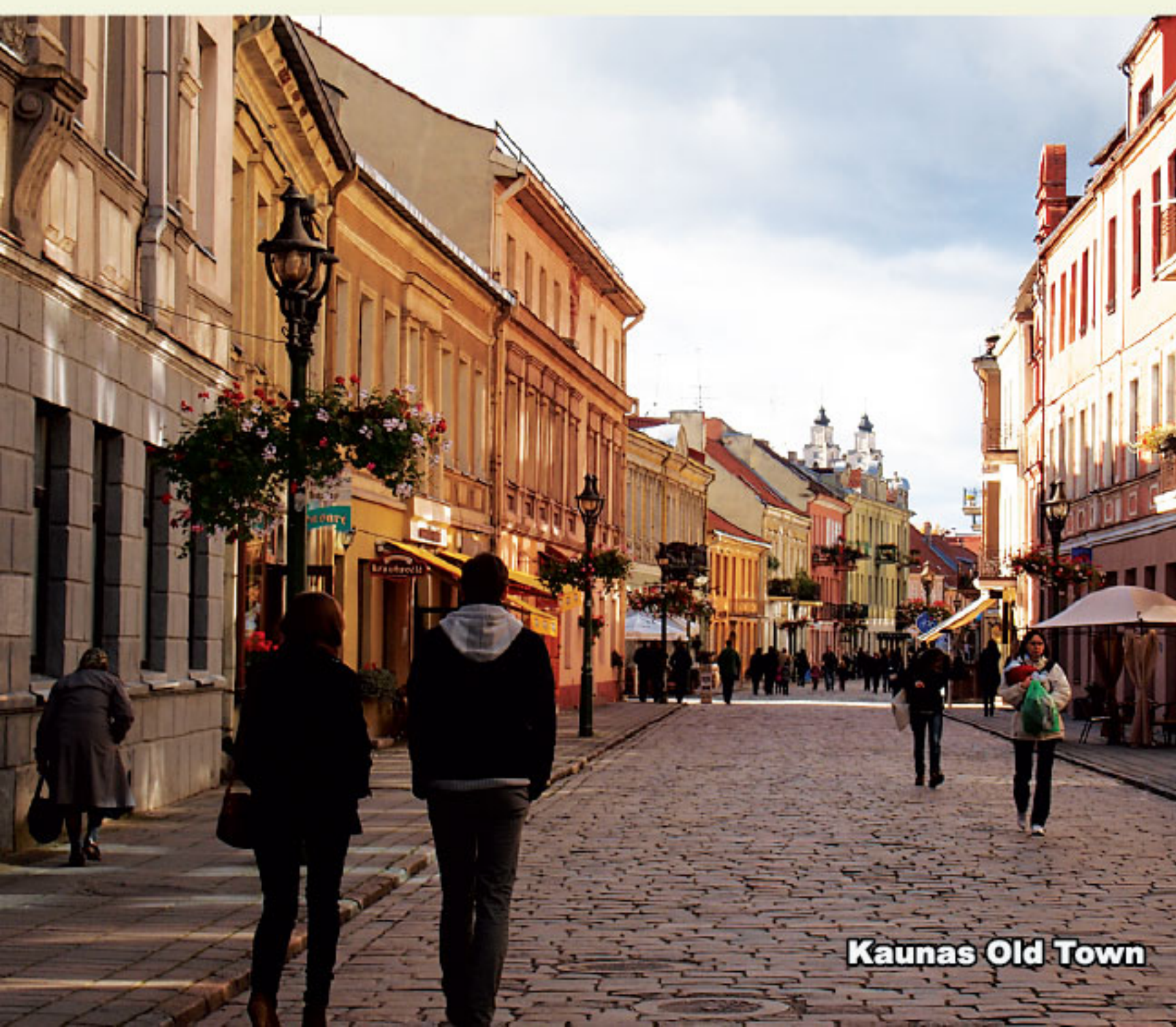
Kaunas Old Town