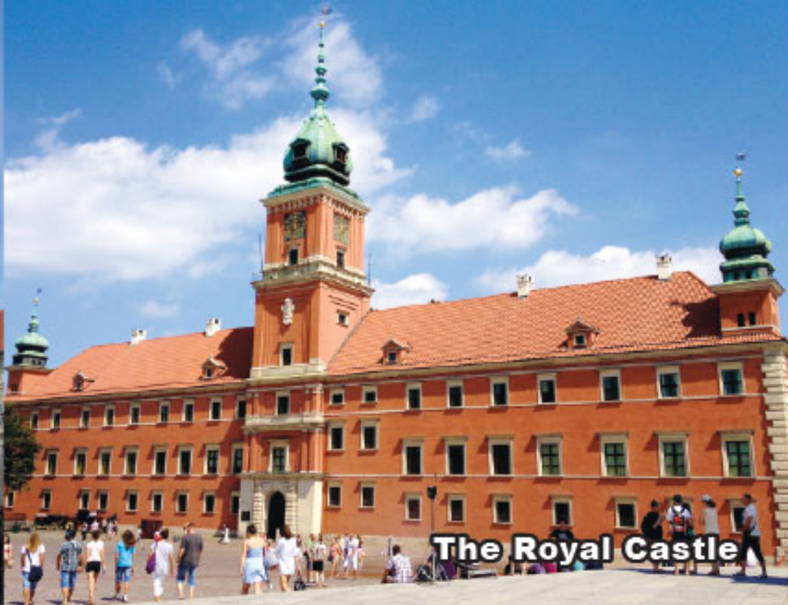
The Royal Castle