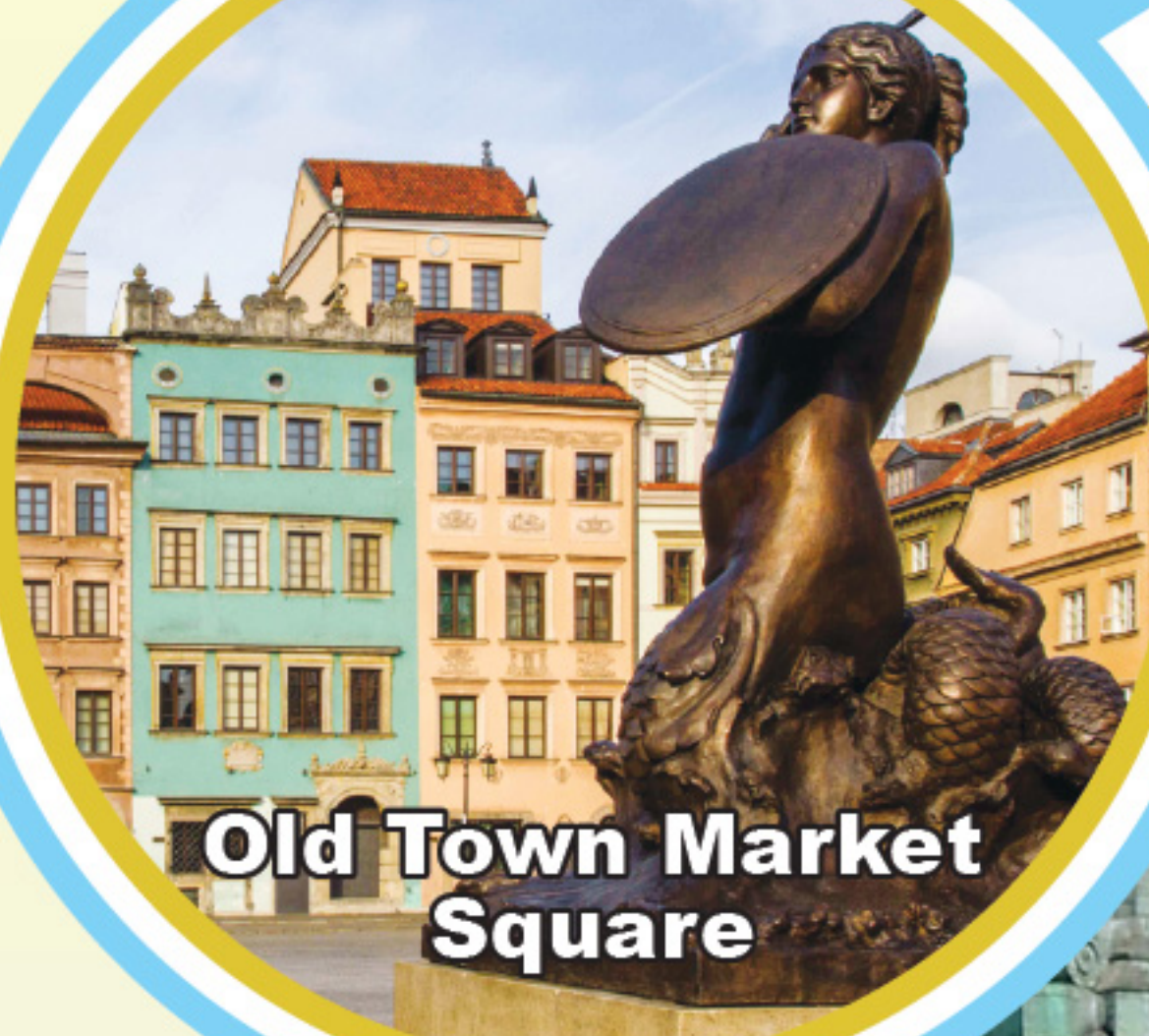
Old Town Market Square