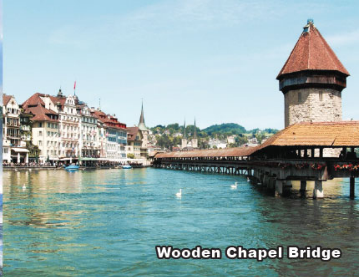
Wooden Chapel Bridge